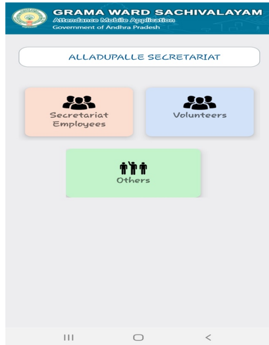
Home Screen of the Attendance app